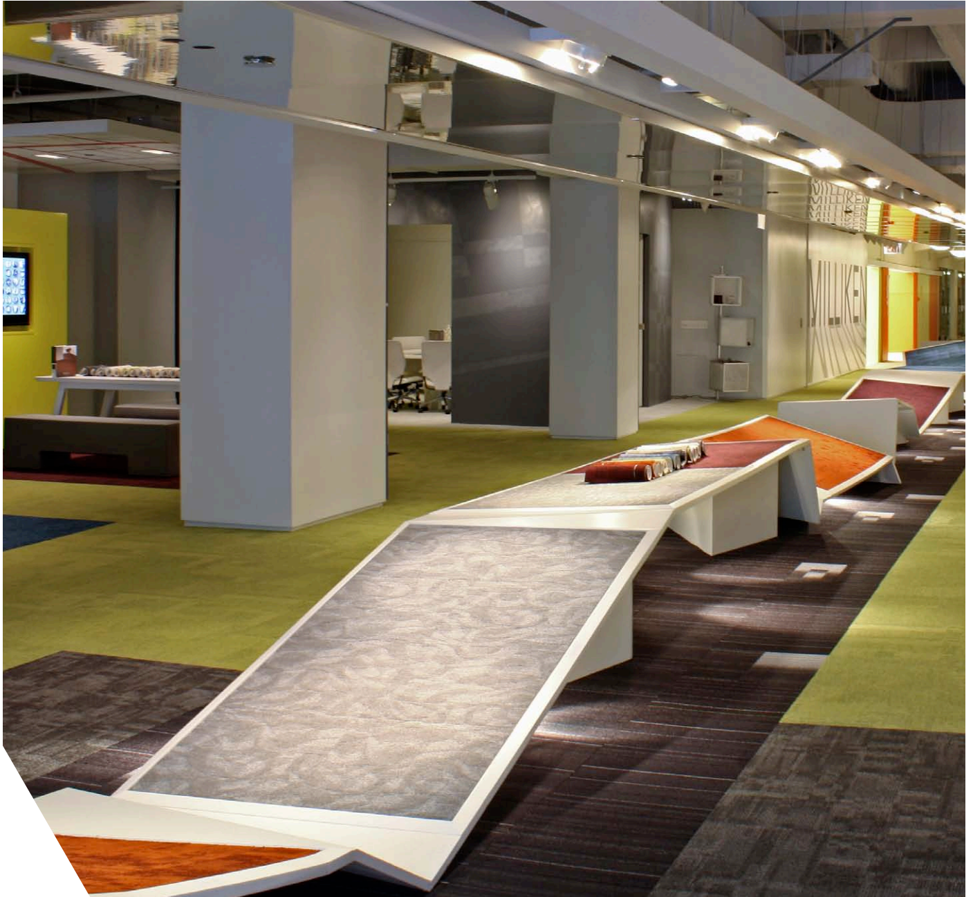
Milliken Showroom, Chicago, IL